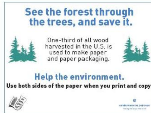
Figure 2. Sample poster that encourages double-sided printing and copying.

for example, to hold a contest, post signs [33] at copiers (see Figure 2), host a potluck, start a newsletter, laugh at yourself, throw a party, tell a story, or make a modest proposal.